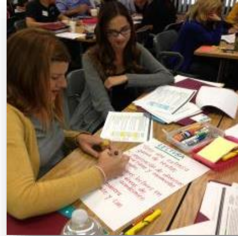
Pre-service Teachers work with Common Core en Español