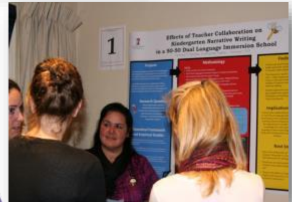
In-service Teachers present Dual Language Action Research